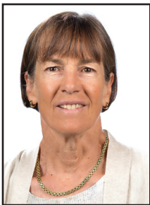
TARA VANDERVEER HEAD COACH 35TH YEAR