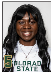
UPE ATOSU Gr. • G • 5-9 Edo State, Nigeria Scholars Imperial/Butler