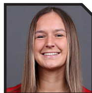
10 BRI LANG M | Fr. Upper St. Clair, Pa. Upper St. Clair