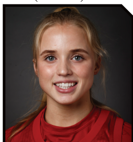
10 Hailey Van Lith G | 5-7 | Fr. Wenatchee, Wash. (Cashmere)